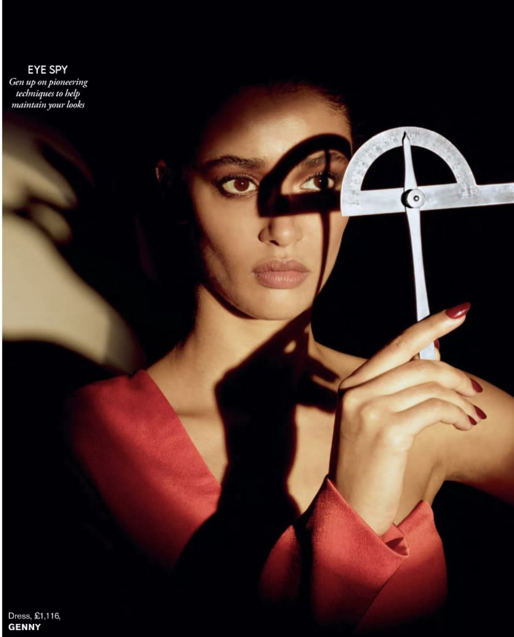
Dress, £1,116, GENNY

Gen up on pioneering techniques to help maintain your looks