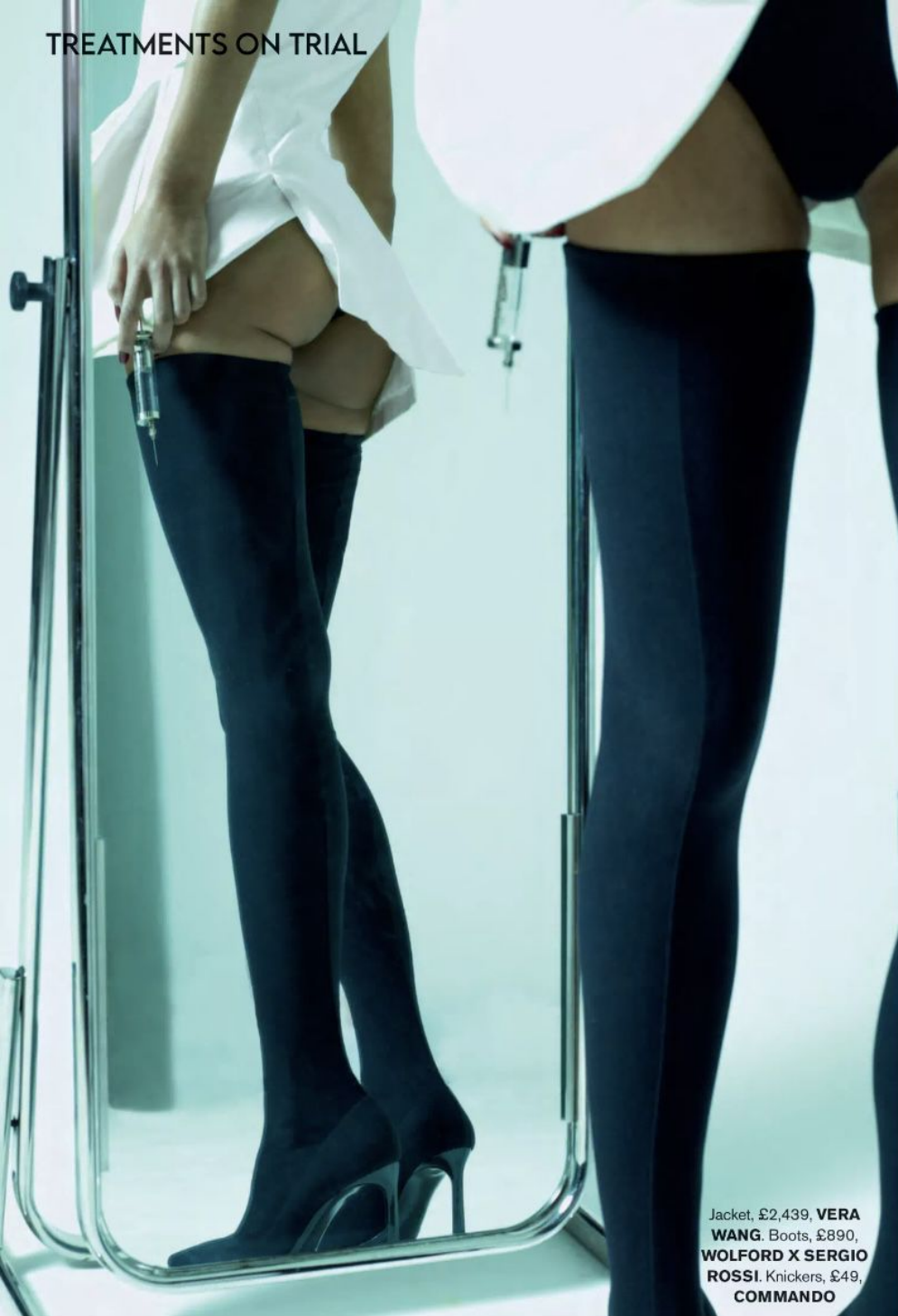
Jacket, £2,439, VERA WANG . Boots, £890, WOLFORD X SERGIO ROSSI . Knickers, £49, COMMANDO